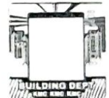
Asst. Engr/Executive Engr by order (Municipal Commissioner) Executive Engineer (Civil) Building Department / Borough-XII The Kolkata Municipal Corporation

(Signature and designation of the Officer to whom powers have been delegated)